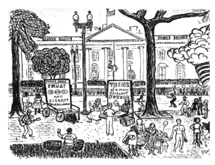
Longest Continuous Vigil Anywhere?